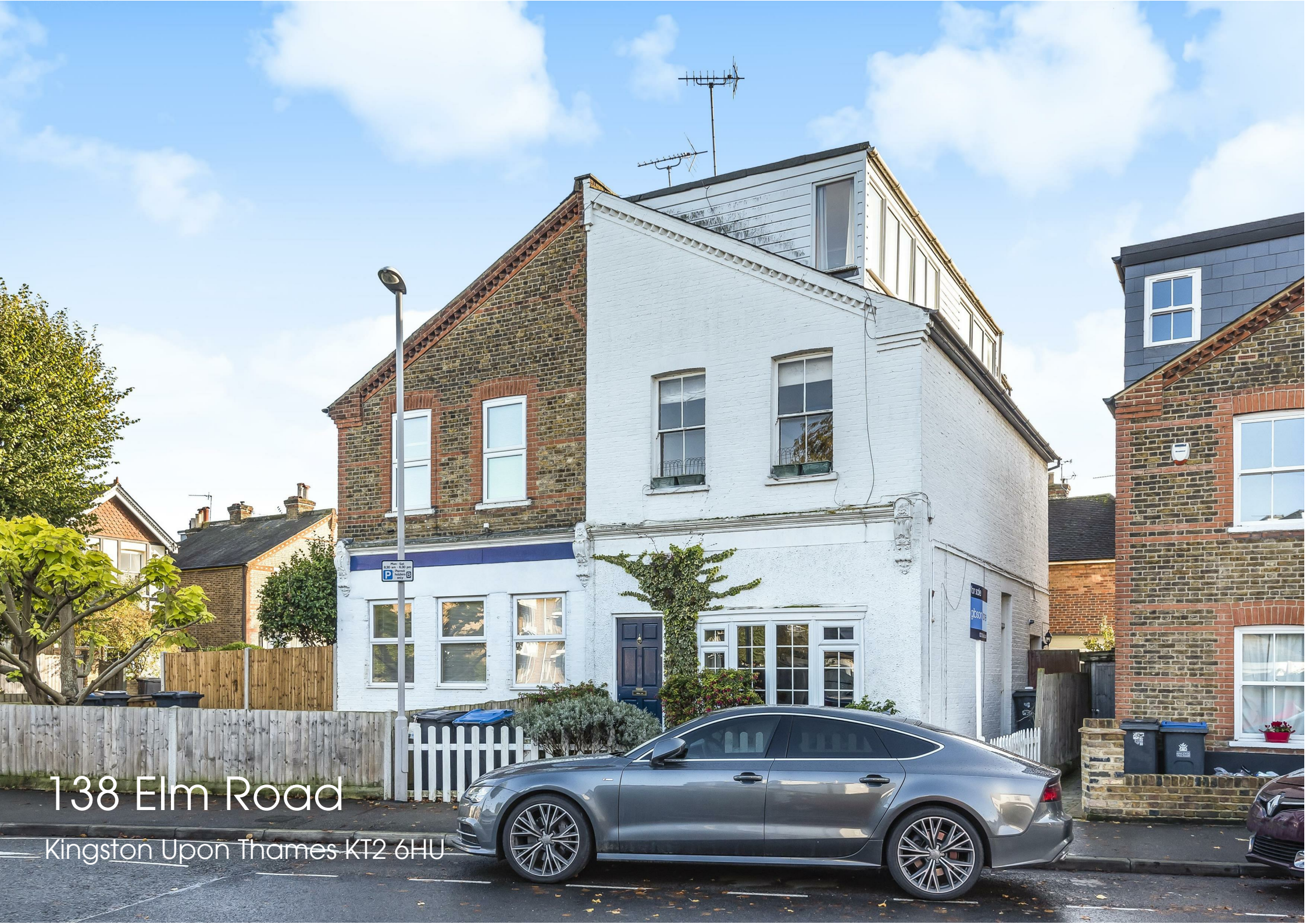
138 Elm Road Kingston upon Thames KT2 6HU

34 Richmond Road Kingston upon Thames Surrey KT2 5ED www.gibsonlane.co.uk Tel: 020 8546 5444